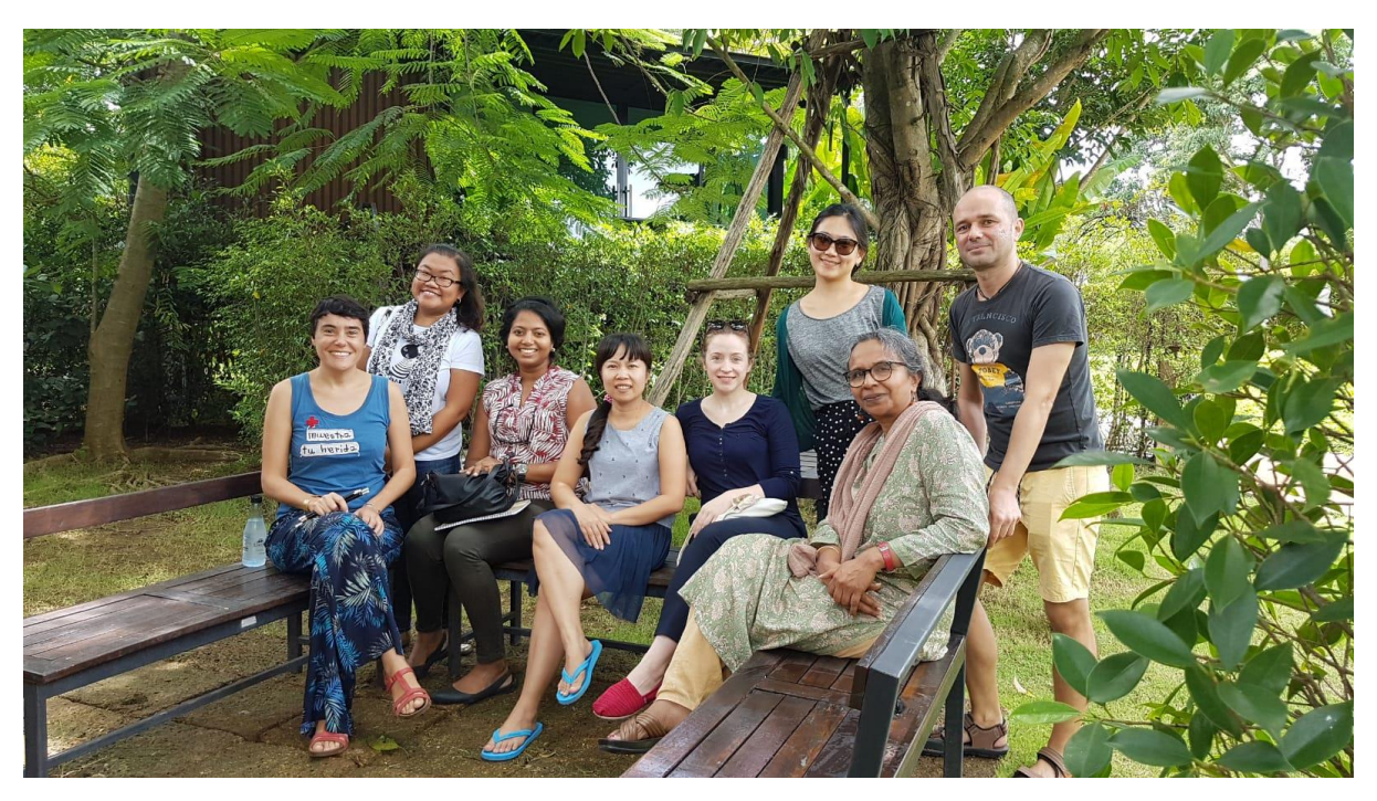
Prepared by: GAATW International Secretariat